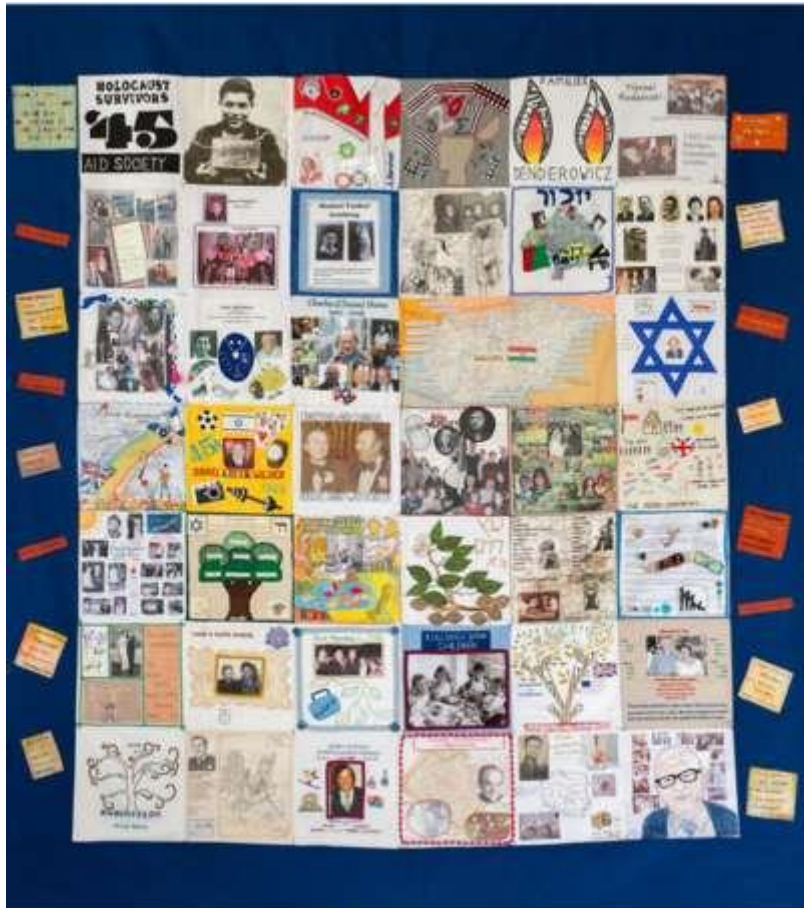
45 Aid Society