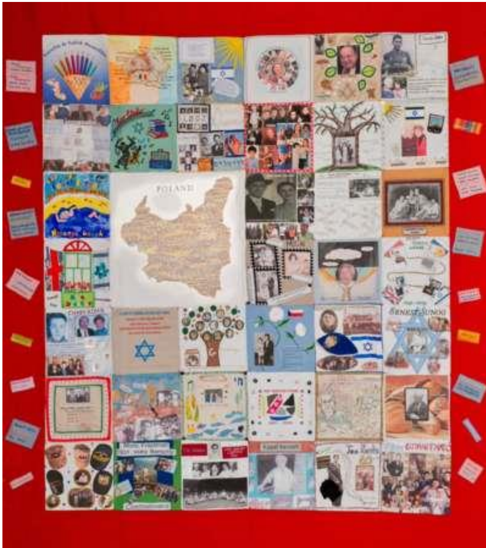
45 Aid Society

Holocaust survivors have created a memory quilt to celebrate 70 years in the UK.